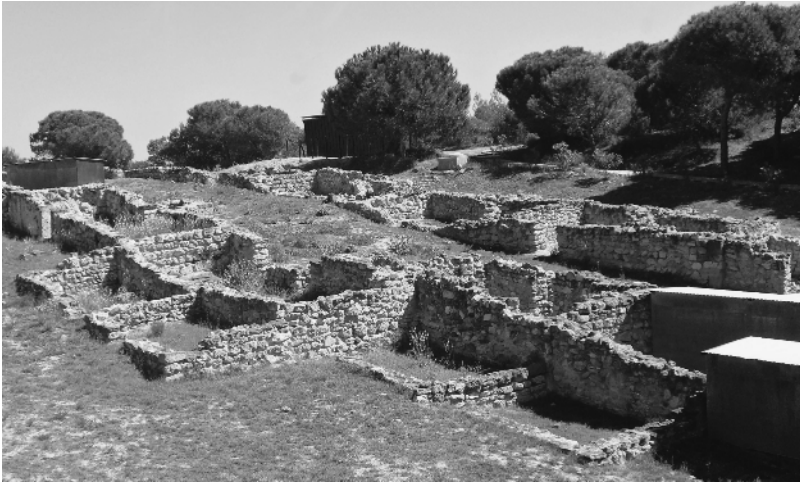
Figure 1.4 The First Sufi Institutions: The Ribat at Guardamar, Spain

More through the serendipities of preservation and archaeological research than through any innate chronological primacy, probably the earliest surviving version of one of these Sufi lodges is found in the far west of the medieval Islamic world in Spain. This is the tenth century ribat that was excavated in the late 1980s from the coastal sand dunes at Guardamar in the modern Spanish province of Valencia, what was at the time of the ribat ’s