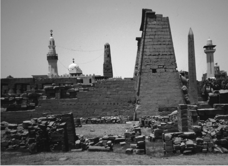
Figure 1.3 Sharing Sacred Geographies: Medieval Shrine of Shaykh Yusuf Abu al-Hajjaj in Luxor Temple, Egypt

theology of Friendship would over time feed a vibrant cult of Sufi saints whose shrines, such as that built for Shaykh Yusuf Abu al-Hajjaj in the former pharaonic temple of Luxor in Egypt, would gradually transform the Middle Eastern landscape into a sacred Islamic geography.