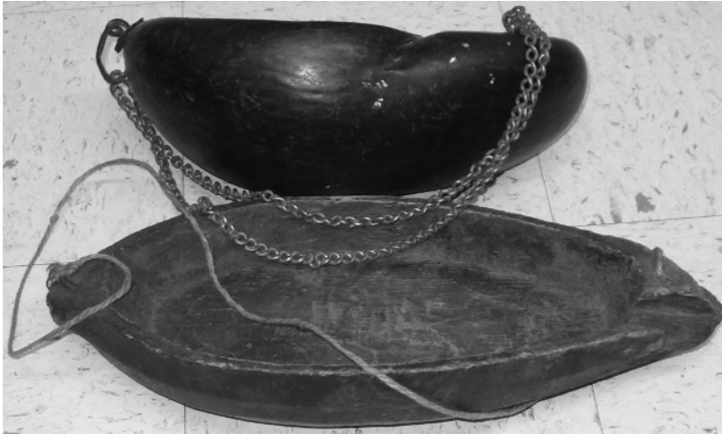
Figure 1.1 Ascetic Lifeways: Wooden and Coco-de-Mer Begging Bowls ( kashkul )

It has long been recognized that the wearing of wool points to similarities with the ascetic activities of the Eastern Christians, particularly in Syria, where between 661 and 750 the Muslims had kept their capital at Damascus before the shift to Iraq with the ascent of the 'Abbasid dynasty. Reacting to nineteenth century fashions for seeking the origins of the Sufis in Indian thought, scholars in the 1930s uncovered detailed evidence on the similarities between Christian and Muslim "ascetics" and it was argued that this