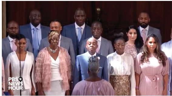
Fig. 9: Kingdom Gospel Choir performs at the wedding of Meghan Markle and Prince Harry (PBS, News Hour, 21 May 2018, 00:38:50). 11

Austria (and, we would argue, also in the rest of Europe) are designed by paid wedding planners as idealistic and individualistic rituals, the sequence that is followed in the preparation and the ritual itself is highly standardized, although open to individual adaptations. 12