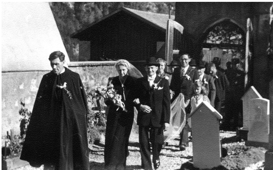
Fig. 10: Black bridal-gowns were normal in the 19th and early 20th centuries. We see here a rural wedding in Grisons, Switzerland, from the 1940s. The pastor walks in front, followed by the bride and groom with a flower girl, and then the guests. Private collection: Höpflinger.

We have observed in relation to the categorization of the private and the public that the media play a crucial role, and their role is also vital for the interaction of tradition and innovation. Traditions are formed through media communication, but at the same time media can make innovation possible, sometimes even defining something as innovative although it is not as novel as people might think. Again the white wedding dress is a good example: after Queen Victoria's wedding, fashion magazines (popular culture media) began to promote white bride-dresses, but it would be another 100 years before the white wedding gown was accepted all over Europe and in the USA. 16 Today TV series, films, or the internet tell their consumers that the coloured or black wedding dress is innovative, and yet it was common up until the 20th century.