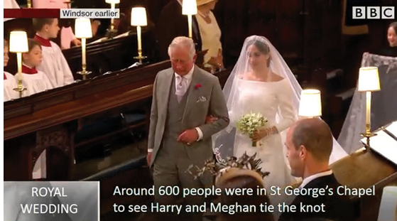
Fig. 5: As the bride's father was absent, Prince Charles escorted Markle down the aisle and up to the altar, almost as he were granting her official access to this semi-private space of a most privileged family (BBC News, Royal Wedding, Live from Windsor, 19 May 2018, 00:04:45). 7

The television coverage of the ceremony at St. George's Chapel enabled the viewing of semi-private spaces. The camera view provided privileged access to central moments of the ritual, for example when the bride entered the chapel by herself (fig. 4), when Prince Charles, her future father-in-law, escorted Markle from half way down the main aisle to the altar (fig. 5), or when vows were made during the ceremony within the church (fig. 6).