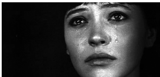
Fig. 11: VIVRE SA VIE (Jean-Luc Godard, FR 1962): Nina watching Dreyer's JOAN OF ARC ( LA PASSION DE JEANNE D'ARC , FR 1928) in the dark of the Panthéon cinema. The watcher becomes the watched that is the watcher that is the watched. Every book is thus written by a scribe; she writes the book, but the book, in turn, writes her, too.