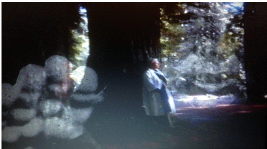
Fig. 4: HISTOIRE(S) DU CINÉMA: LE CONTRÔLE DE L'UNIVERS (Jean-Luc Godard, FR/CH 1998). "So it's a braless blond followed by a detective scared of heights who will prove that this is all just cinema, which means it's child's play", 19 says Godard in his reflection on Hitchcock's VERTIGO (US 1958). The question is if we can make every science and art as playful, simple, intuitive, and unpretentious as the child's play that Godard's vision of filmmaking and quite possibly every other creative process was and liberate our minds from the stifling chains of adulterated extravagance thereby.

sell-out phoniness spilling out like vomit from corporate offices, grocery stores, coffee shops, concert venues, billboards, ads and TV, itself the reason why he has heartily refused to appear on TV all throughout his lifetime, but there is also a perpetual wonder whether prostitution as giving oneself wholly to another, albeit promiscuously, has also been a way of liberating the spirits of some of his favorite female protagonists. Take, for example, the ambiguous 360 degree panning shot preceding the final shot of 2 OU 3 CHOSES QUE JE SAIS D'ELLE – does it prove that the protagonist, Juliette Janson, has finally become the world, the way she had dreamt of, or does it demonstrate a sense of being more lost than ever in this inhumane, mechanical, soulless world of skyscrapers and sickening staginess? But that is the sign of the greatness of one's work – it cannot be pre-planned and it will keep the quarreling critics busy for ages to come.