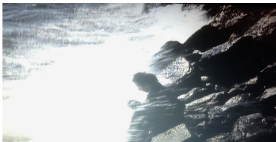
Fig. 1: HISTOIRE(S) DU CINEMA: UNE VAGUE NOUVELLE (Jean-Luc Godard, FR/CH 1998) – “It’s about time that the thought becomes once again what it really is: dangerous for the thinker.” 3