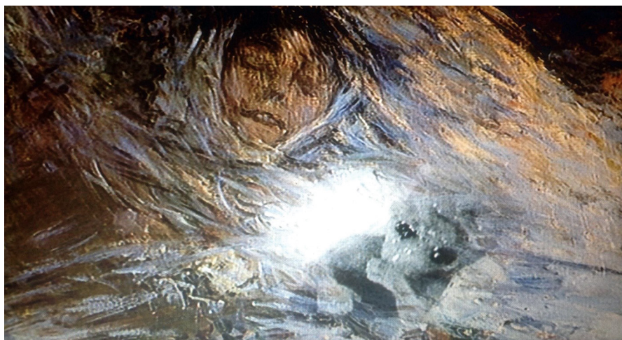
Fig. 13: HISTOIRE(S) DU CINÉMA: LA MONNAIE DE L'ABSOLU (Jean-Luc Godard, FR/CH 1998). "... here is the question, it's bigger than India, England or Russia, it's the small child inside the mother's womb".

realized that they have long disappeared into the dark of the night. If the key attempt of Godard's filmmaking was to use cinema as a tool that obliterates that very same tool and shows us the beauty of life, the only faithful way to end this essay is to use the words piled up here as a tool to destroy that very same tool and, like Wittgenstein at the end of his debut treatise 66 , leave us speechless and in awe under the starry sky of life and its infinite beauties, lying beyond what any camera or pen could capture. The purpose of this whole array of words is, therefore, to make the reader look away from them, being the same goal that Godard strived to attain throughout his entire filmmaking career. For, what point other than this could Godard be making with the opening scene of LA PARESSE , where the female protagonist reads a book and the page she reads shows an unpunctuated, grammatically broken excerpt from Beckett's Comment C'est : "Suddenly afar the step the voice nothing then suddenly something something then suddenly nothing suddenly afar the silence" 67 "Reality", after all, "is too complex for oral communication", as it is said in the opening scene of ALPHAVILLE , and all that language is, as Juliette from 2 OU 3 CHOSES QUE JE SAIS D'ELLE reminds us, is "the house man lives in", 68 suggesting the safety and comfort that abiding in it brings, but equally insinuating that the most exciting things, life as it were, happen strictly outside of it.