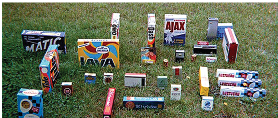
Fig. 8: 2 OU 3 CHOSES QUE JE SAIS D'ELLE (Jean-Luc Godard, FR/IT 1967). The final image, of a colorful graveyard composed of boxes of detergents and other inanimate denizens of supermarket shelves, epitomizes the essence of the deliberately shallow pop artiness; does it arise from a state of true enlightenment or from sheer stupidity and years of brainwashing with the surface values? Not incidentally at all, in this miniature model of a luxurious high-rise banlieue of Paris, itself a model of an alienating urban landscape, itself a model of modern society, one finds a box of Hollywood bubblegum.

being that not even the finest traces of submission to social standards could be found therein. Still, science is indisputably a social question and must be analyzed from a variety of nonscientific perspectives in order to be approached in a creative fashion. For this reason, the narrowness and linearity of the scientific method followed by the academic masses is mercilessly fought against in my lab and classroom, all in an attempt to lift this new generation of scientists to the top of Bloom's taxonomy pyramid, where the creative and the metacognitive intersect. 38 As for (b), the aim has been to discard the old, rigid way of presenting science, be it in the written or the oral form, and substitute it with a style that signifies spontaneity and more veritably reflects the route to innovative ideas along the corridors of the human mind, which is such that it relies on analogies, poetry, swells of aesthetic senses and intuitive flashes of light along the way. As for (c), the idea that siding with the disempowered must be the way to go in my roaming through the chambers of the Kafkaesque castle that the Ivory Tower is has been another guiding light, the reason why everything, from experimental methods to research subjects to researchers and collaborators to research locations to political voices aired through these lungs, has been adjusted to afflict the affluent and uplift the poor and the underprivileged.