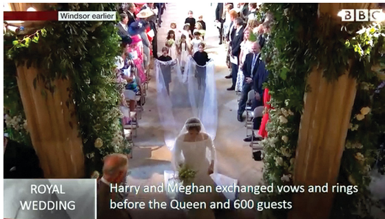
Fig. 4: From a high angle, the camera shows the bride and the flower bearers carrying her veil. The view underlines the nature of her walk to the altar, in part unaccompanied, and the threshold between the two spaces occupied by the invited guests: the first part as she walks down the aisle seen by a broader audience, and thus a semi-public space, and the second part seen by members of the royal family, the clergy, the choir, and few chosen guests, and thus a semi-private space (BBC News, Royal Wedding, Live from Windsor, 19 May 2018, 00:04:20). 6