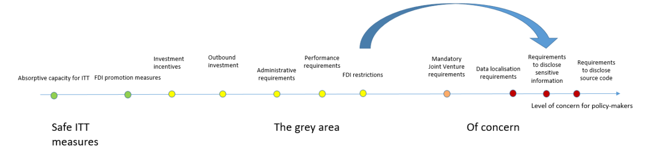
Figure 5. The requirement to disclose sensitive information related to FDI restrictions

Findings from literature can shed light on the motivations of host countries that have sought to require foreign investors to enter into joint ventures. Kokko (1994) studies Mexican manufacturing data and shows that when there is both a high technological gap and high foreign share ownership, spillovers are less likely, but that the large technological gap alone does not pose as much of a challenge. Javorcik (2004), using firm level survey data from Lithuania, shows that there are positive productivity spillovers from FDI to local suppliers and that these are significant in the case of shared ownership, but not in the case of fully owned foreign investments. Ghebrihiwet (2017) shows that there is more technology transfer under acquisition than under direct entry.